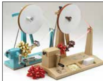
S72 & S81 Star Bow Machines