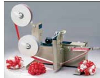
S-13 Pom Bow Machine

Our Flora-Satin and Sparkalene ribbon are the perfect width for the bow machines and therefore you can be free of star bows with flipped loops. Our ribbons are embossed which helps the machine grip and pull the ribbon properly. The cores are made to fit the machines so no adapters are needed. These ribbons can also be used on the S-13 pom bow machine, however if you prefer more fabric feel and an easier pull when opening, try the satin acetate below.