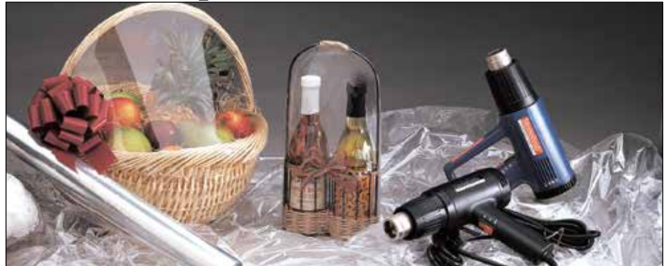
Crystal Clear • FDA Compliant for Direct Food Contact • Shrinks at Low Temperatures 45% | 45% Shrink Factor