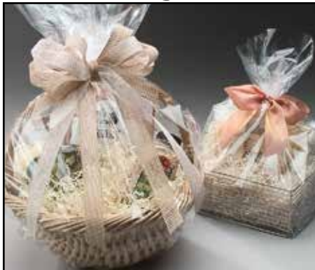
Basket Bags retain shape & don't shrink. FDA Compliant for Direct Food Contact