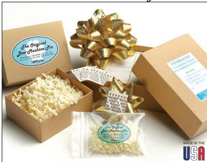
The Original 3M Bow Machine Pin