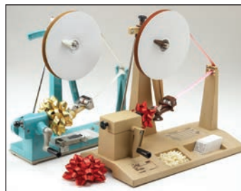
S72 & S81 Star Bow Machines