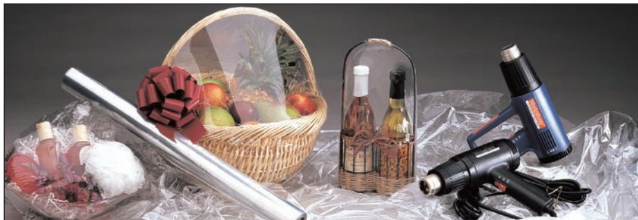
Crystal Clear • FDA Compliant for Direct Food Contact • Shrinks at Low Temperatures 45% / 45% Shrink Factor