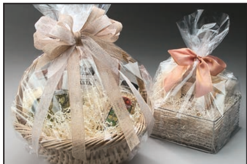
Basket Bags retain shape & don't shrink. FDA Compliant for Direct Food Contact