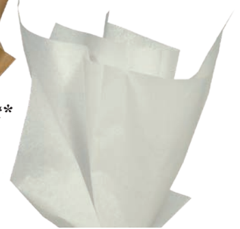
Industrial Packing Tissue