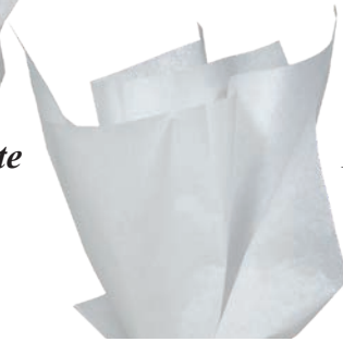
Premium #1 White*