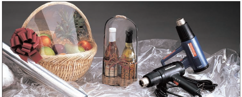
Crystal Clear • FDA Compliant for Direct Food Contact • Shrinks at Low Temperatures 45% / 45% Shrink Factor