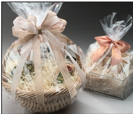
Basket Bags retain shape & don't shrink. FDA Compliant for Direct Food Contact