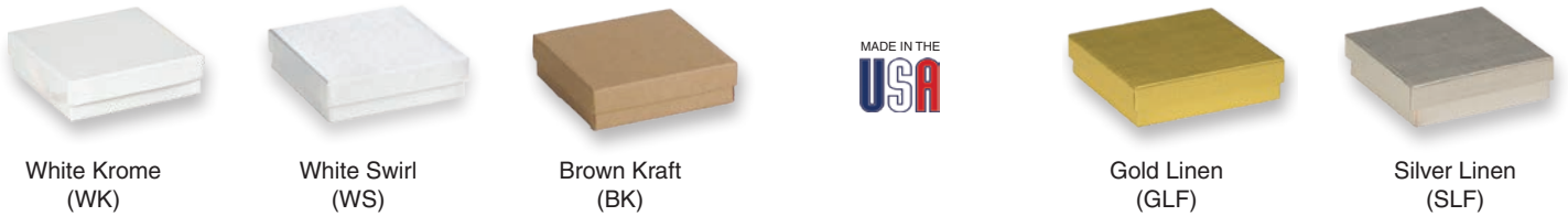
White Krome (WK)