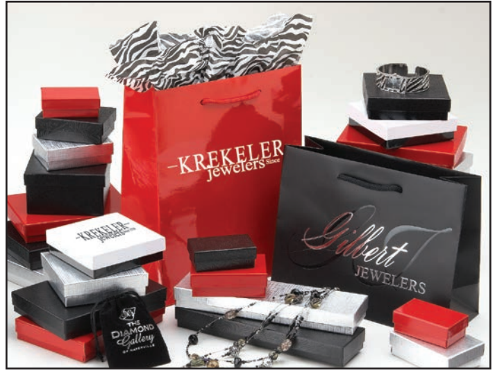
Cotton filled Jewelry Boxes Platforms Sold Separately