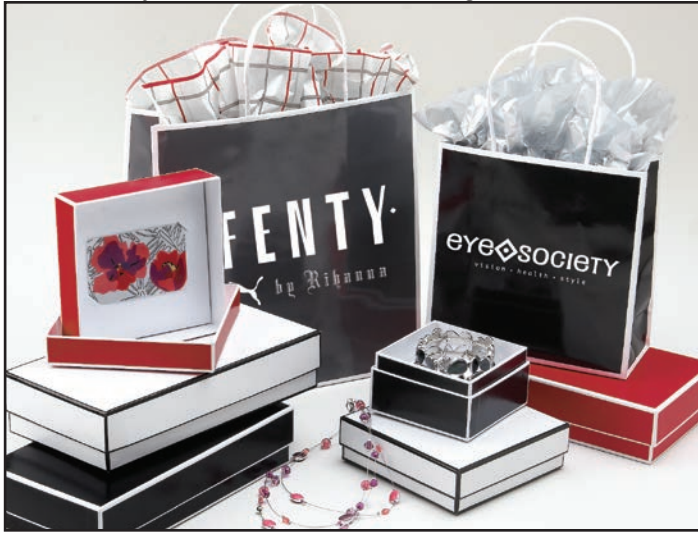
Sophie Jewelry Boxes & Bags Platforms Included *Indicates special order colors