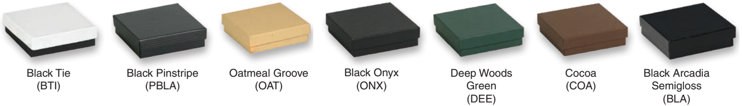
Black Tie (BTI)