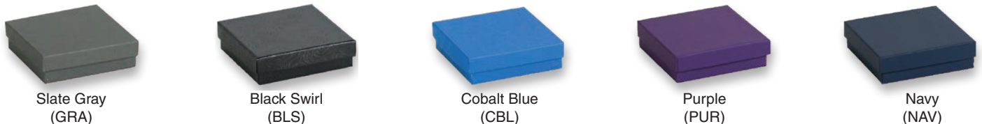
Slate Gray (GRA)