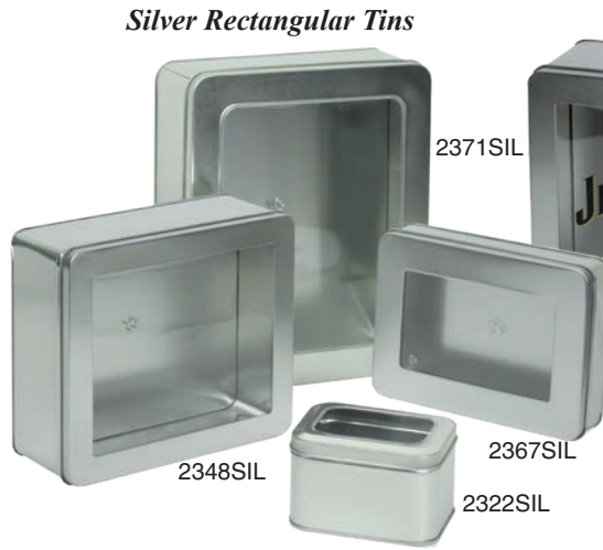
Silver Rectangular Tins