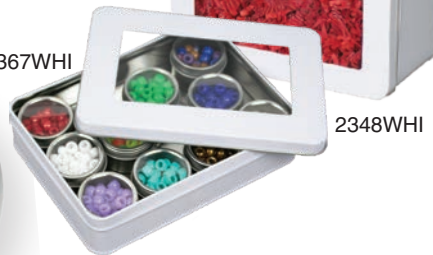
Gift Card Tins