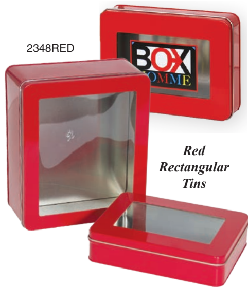
Red Rectangular Tins