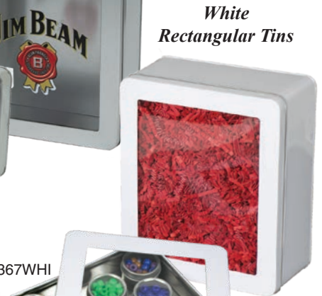
White Rectangular Tins