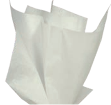
Industrial Packing Tissue