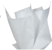
Premium #1 White