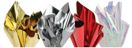
Gold (GOL) Silver (SIL) Red (RED) Iridescent (IRI)