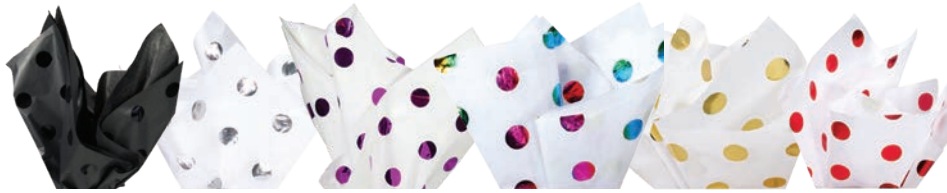
Black HS1016 B Silver HS1012 B Hot Pink HS1017 B Rainbow HS1014 B Gold HS1010 B Red HS1011 B