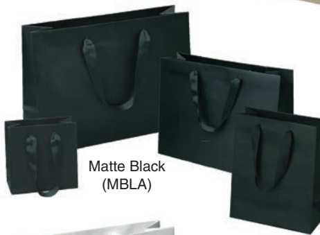
Matte Black (MBLA)