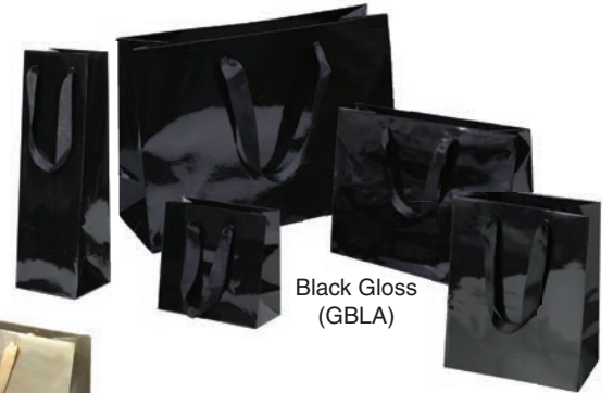
Black Gloss (GBLA)