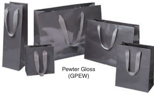
Pewter Gloss (GPEW)