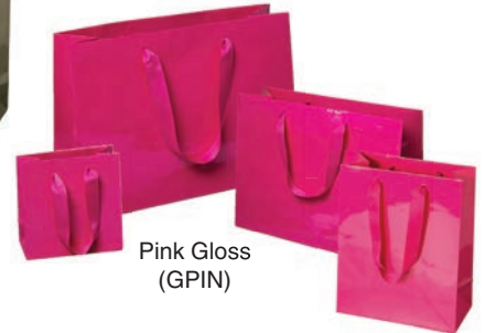
Pink Gloss (GPIN)