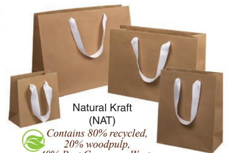
Natural Kraft (NAT)