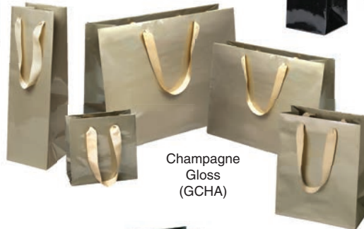
Champagne Gloss (GCHA)