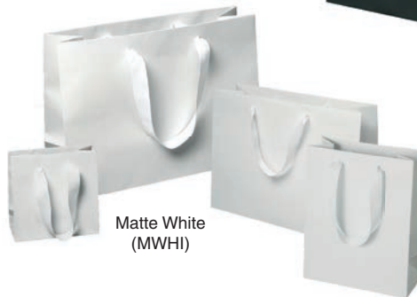
Matte White (MWHI)