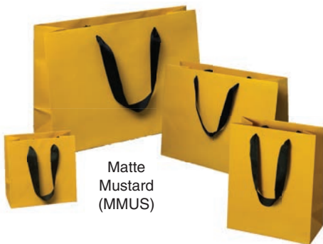
Matte Mustard (MMUS)