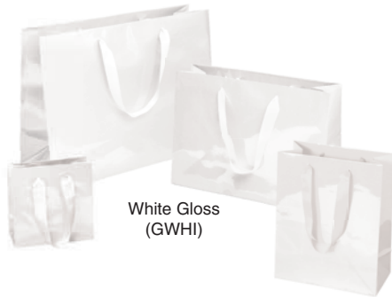
White Gloss (GWHI)